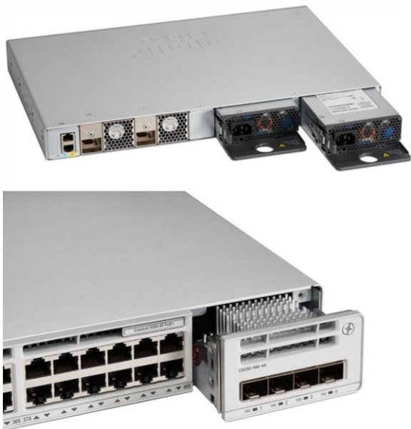
Figure 3. Cisco Catalyst 9200 Series Switch dual redundant power supplies

Table 4 lists the PoE power availability for each model.