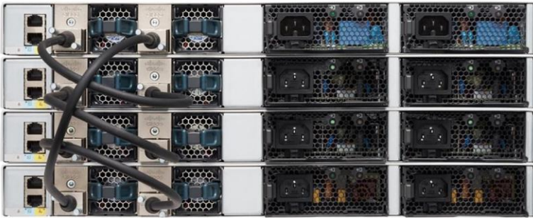
Figure 4. Cisco Catalyst 9200 Series Switch stacked units