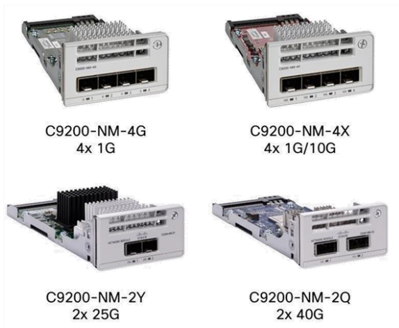
Figure 2. Cisco Catalyst 9200 Series Switch network modules

Cisco Catalyst 9200 Series switches come with modular or fixed uplinks as indicated in Table 1. With modular SKUs, the field-replaceable network modules provide infrastructure investment protection by allowing a nondisruptive migration from 1G to 10G and beyond. When you purchase the switch, you can choose from the network modules described in Table 3.