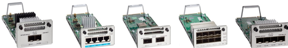
Figure 3. Cisco Catalyst 9300 Series Network Modules