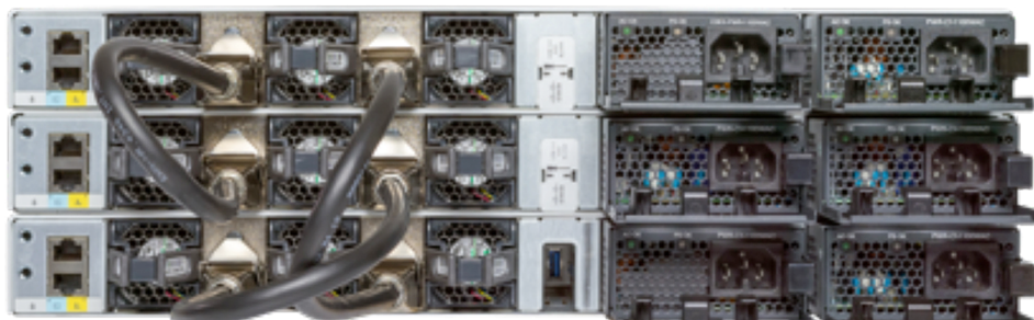
Figure 6. Cisco Catalyst 9300 Series fixed uplink models with optional stack kit