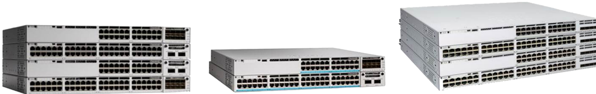
Figure 1. Cisco Catalyst 9300 Series switches

The Cisco Catalyst 9300 Series is made up of nineteen modular uplink switch models and fourteen fixed uplink switch models.